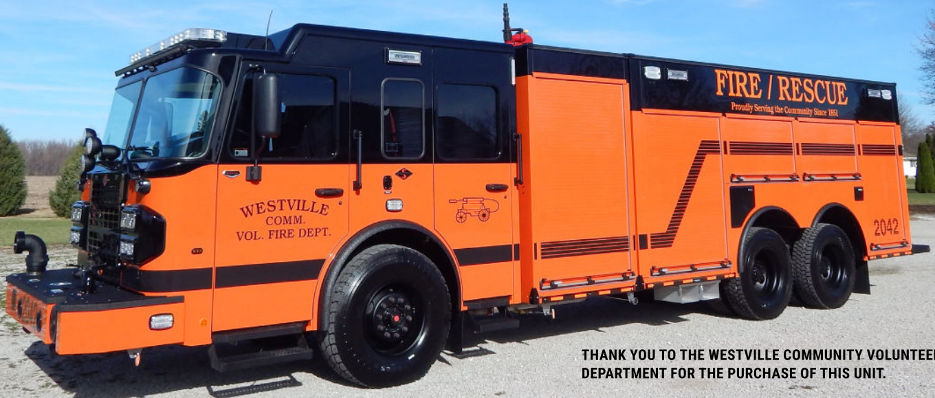
THANK YOU TO THE WESTVILLE COMMUNITY VOLUNTEER FIRE DEPARTMENT FOR THE PURCHASE OF THIS UNIT.