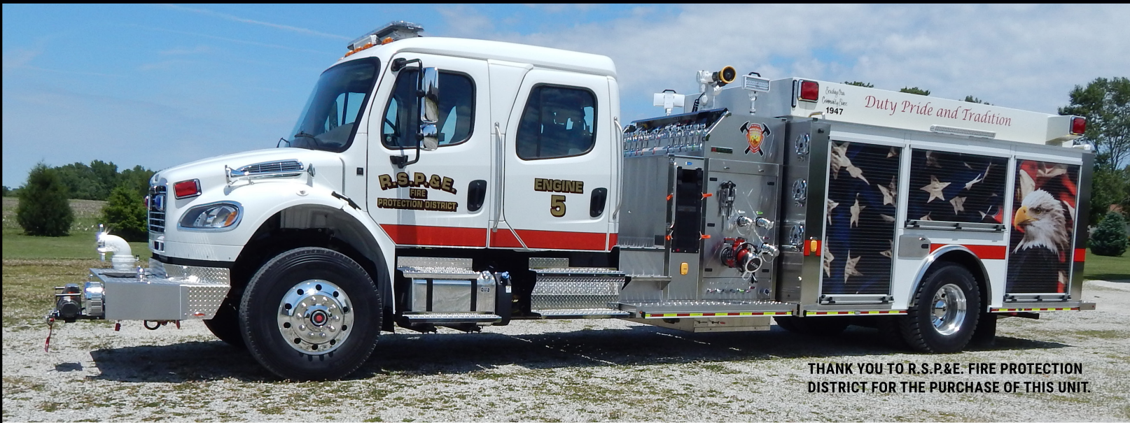
THANK YOU TO R.S.P.&E. FIRE PROTECTION DISTRICT FOR THE PURCHASE OF THIS UNIT.