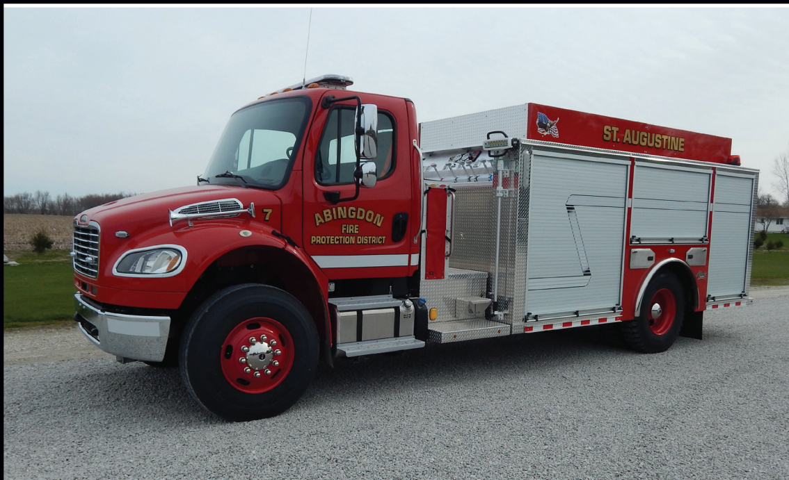
ABINGDON FIRE PROTECTION DISTRICT :: ST. AUGUSTINE UNIT ABINGDON, ILLINOIS