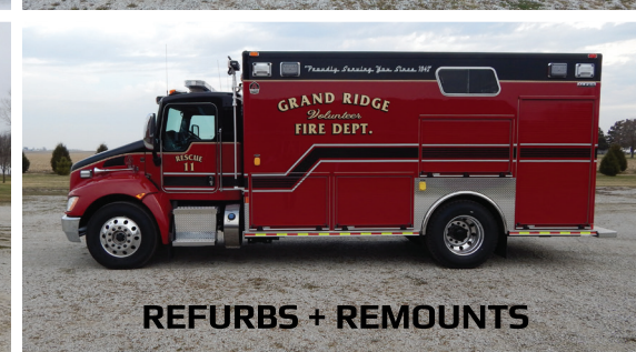
REFURBS + REMOUNTS