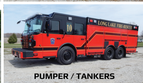
PUMPER / TANKERS