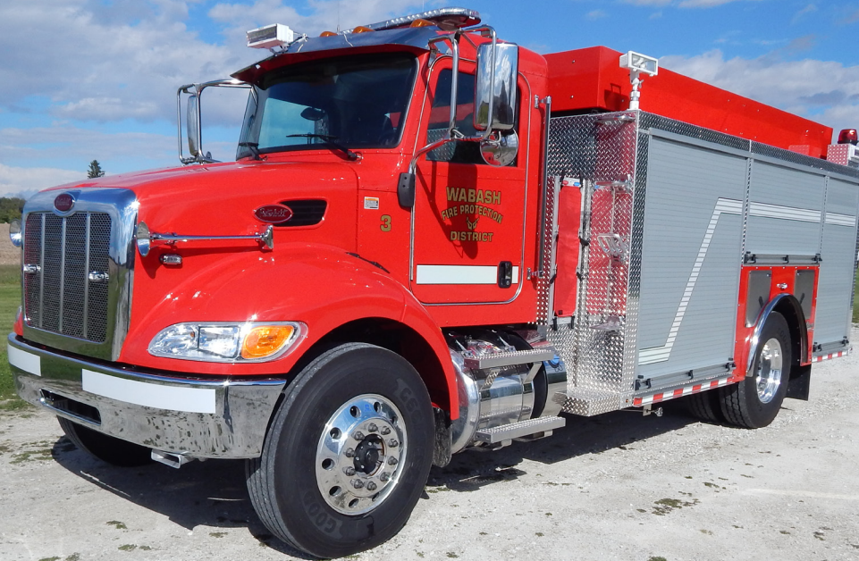
WABASH FIRE PROTECTION DISTRICT MATTOON, ILLINOIS