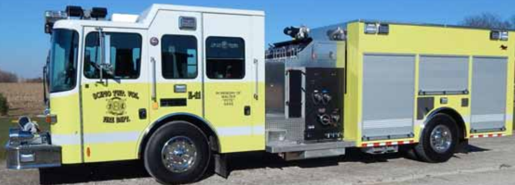
SCPIO TOWNSHIP LA PORTE, INDIANA