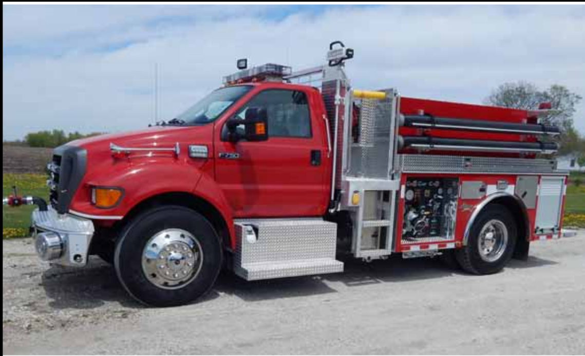
OTTO TOWNSHIP FIRE PROTECTION DISTRICT CHEBANSE, ILLINOIS