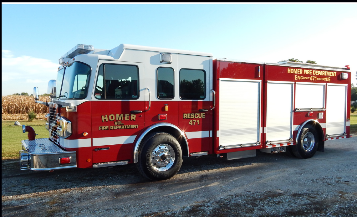
HOMER-BURLINGTON FIRE DEPARTMENT HOMER, OHIO