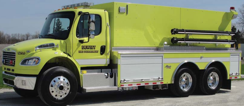
DEWITT VOLUNTEER FIRE DEPARTMENT INC. DEWITT, IOWA