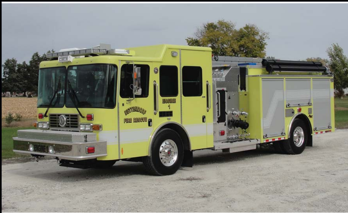
CITY OF BETTENDORF FIRE DEPARTMENT BETTENDORF, IOWA