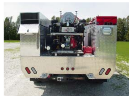
To view more photos of this unit, visit us on the web at www.AlexisFire.com.

We would like to thank the Altona Fire Protection District for their business.