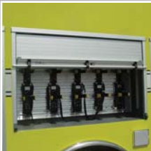
Compartments can be supplied with roller shutter and/or doors.

Alexis Fire Equipment is currently one of four fire equipment manufacturers in the United States offering this innovative and brand new European Glassfibre Reinforced Polyester construction body from Plastisol for custom-built fire apparatus. Ask your Alexis Sales Representative for more information.