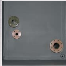
Full pipe work will be integrated with all fittings in their position.