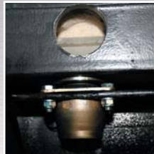
All bodies are self-supported and utilize Plastisol patented floor construction, mounted with metacones.