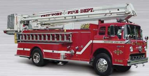
Fruitport Aerial - Before (Cover: Fruitport Aerial - After)

The traditions and continual goals of Alexis Fire Equipment Company are to manufacture fire and rescue apparatus of unsurpassed quality, safety, design and value that meet customer requirements. The company will strive to maintain the tradition through continual improvement of the QMS, build technologies, increasing our market share, and excel in education of our employees.